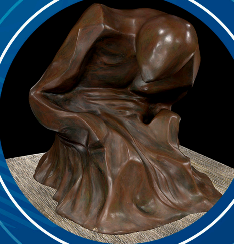
THE VULNERABILITY OF OLD AGE