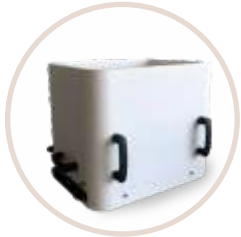
Stratasys H350 build removal box