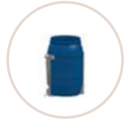
Stratasys H350 powder container