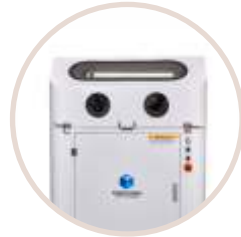
Powder retrieval station

Solution for Stratasys H350 printer or your choice