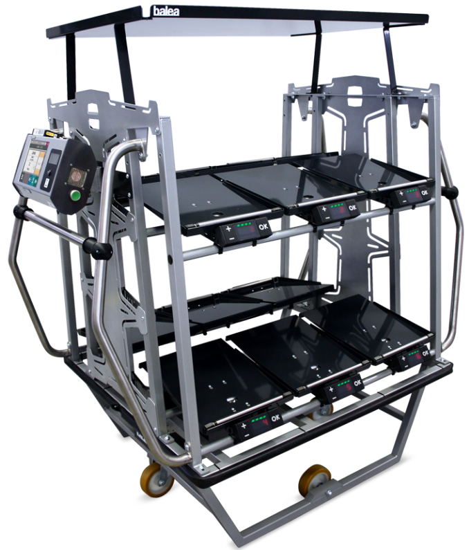
Balea trolley equipped with electronic weighing systems to load the right amount of goods during preparation of orders.

“Our workflow efficiency is also given a boost by the GrabCAD Print software that is loaded on the printer. This lets us print straight from CAD files, which saves an enormous amount of time. Overall, we have accelerated the whole design cycle — from the design itself, to the decision-making, testing and final-part manufacturing.”