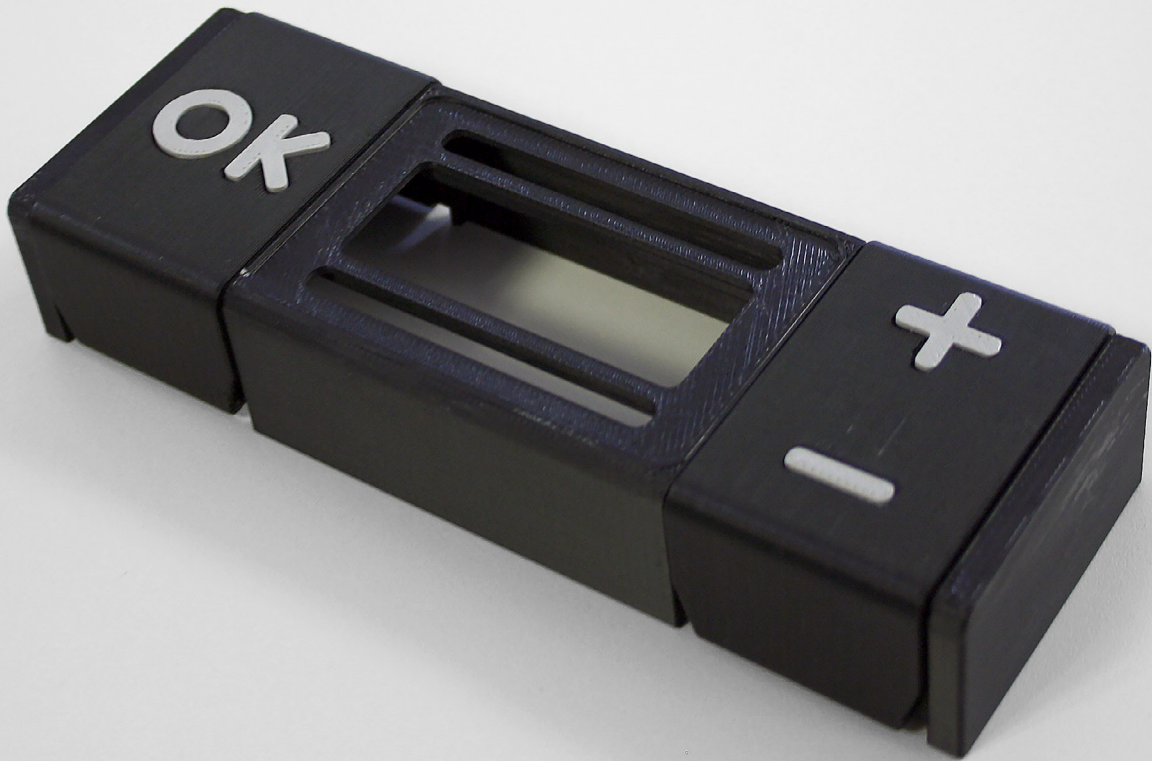
Outer case prototype that houses an electronic weighing system, 3D printed in ASA material.