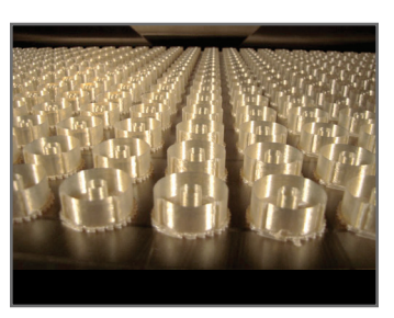
Toroid housings ready for shipment in only 3 days