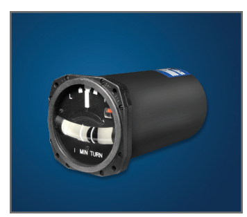
M3500 turn and bank instrument.

Since learning about direct digital manufacturing with FDM for the toroid housing, KMC has also begun to use Rapid PSI's Fortus machines, with PC and ABS materials for its larger prototyping applications. "Unlike our previous rapid prototypes, FDM parts can be used for functional testing because they're made of the same materials we use for production parts," Kelly said. "FDM is also more affordable so we have been able to do more R&D than would otherwise be possible."